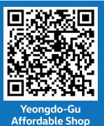
Yeongdo-Gu Affordable Shop

Inquiry Economy Industry Department, Yeongdo Gu Hall ☎419-4478