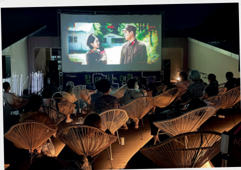
How about a movie vacation