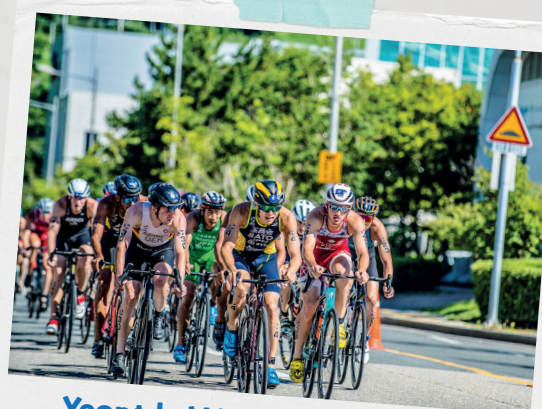
Yeongdo World Triathlon Cup 2023