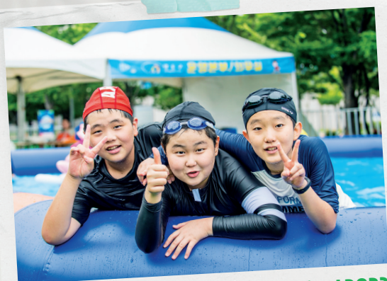
Yeongdo Summer Ocean Festival 2023

This summer, with an unusually long rainy season and heat wave warnings that continued day after day, easily made our bodies and minds tired. However, in the Yeongdo district, various festivals were held to actively fill the tired body and mind with vigor and they received great responses from the participants. In particular, they showed off a new aspect of Busan as a maritime city: a large international competition such as the International Maritime Film Festival during the Yeongdo Summer Ocean Festival 2023, which can only be experienced in Yeongdo, and 'Yeongdo World Triathlon Cup 2023' were successfully held. Let's meet the memorable scenes in pictures together.